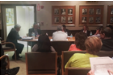
Budget Advisory Committee meeting.

In addition to the increased Capital Projects proposed as part of the recently approved Utility Infrastructure Master Plan, a series of enhancements were adopted as part of the FY 2015/16 budget. These will address a number of quality of life concerns, which have been highlighted by members of the Council or the community at large. These enhancements were developed in an effort to further improve operational effectiveness and efficiency for the Village, and were presented to the Budget Advisory Committee (BAC) as part of the budget development process. The BAC is composed of residents appointed by the Village Council.