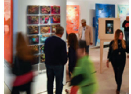
WYNWOOD ART FAIR