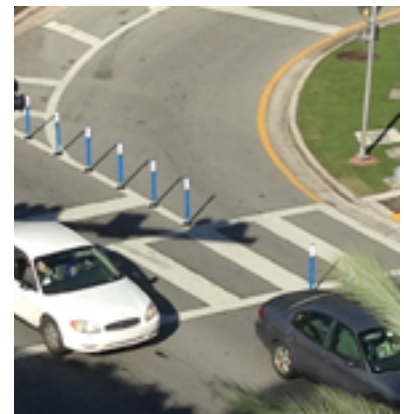
South bound traffic pass newly installed lane delineators on Collins Avenue.

Residents may have noticed the plastic poles installed between the traffic lanes along south bound Collins Avenue in front of Founders Circle. These lane separators/delineators will enhance pedestrian safety and the orderly flow of south bound vehicular traffic. The delineators are designed to prevent vehicles from unlawfully switching lanes, crossing through the pedestrian cross walk and illegally traversing Collins Avenue to enter the Bal Harbor Shops entrance. This is another example of our continued efforts to maximize pedestrian safety. Bal Harbour Village purchased, installed and will maintain these devices.