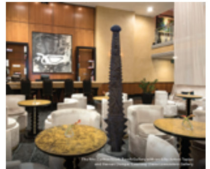
RITZ CARLTON SOUTH BEACH