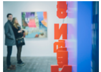
ABOVE AND BELOW, THE ARMORY ART WEEK IN NEW YORK CITY