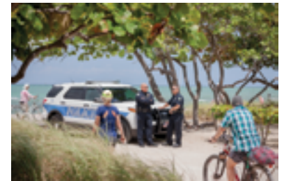
Bal Harbour Police Department patrolling the Village beach.