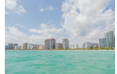
A view of the beautiful beach at Bal Harbour Village.