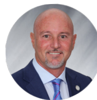
BUZZY SKLAR COUNCILMAN District 3